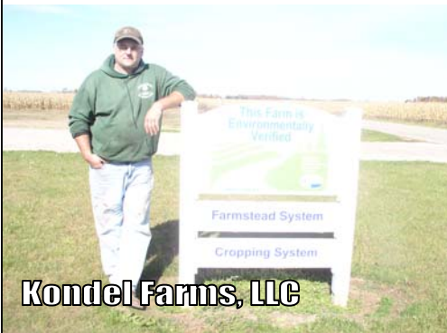
Kondel Farms, LLC