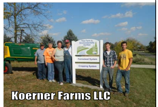
Koerner Farms LLC