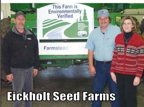
Eickholt Seed Farms